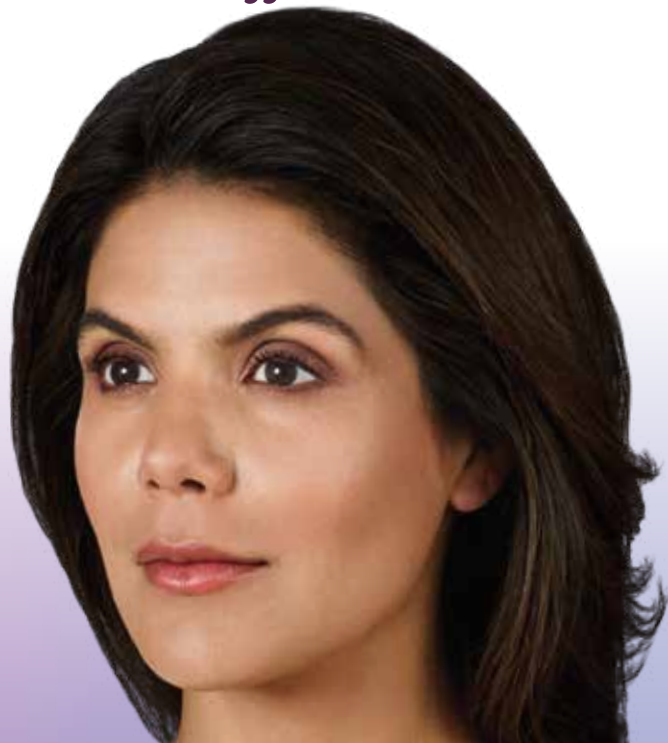
After 1 month