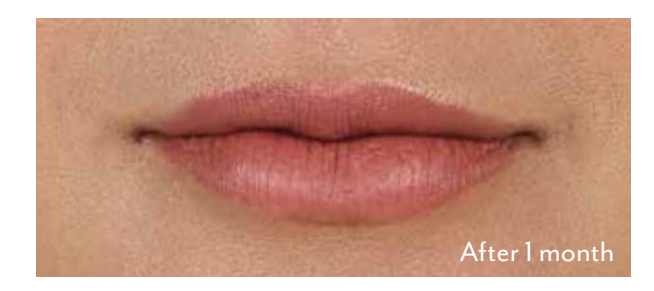
Actual patient. Results may vary.

Unretouched photos taken before treatment and 1 month after treatment. A total of 1.2 mL of JUVÉDERM VOLBELLA* XC was injected in the lips.